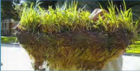
ST. AUGUSTINE GRASS WATERED NO MORE THAN TWICE PER WEEK

HEALTHY LAWNS REQUIRE WATERING NO MORE THAN TWICE A WEEK, AND IF IT RAINS, EVEN LESS. OVERWATERING CAUSES SHALLOW ROOT SYSTEMS AND WEAKENED PLANTS WHICH ARE MORE SUSCEPTIBLE TO DISEASES AND PESTS.