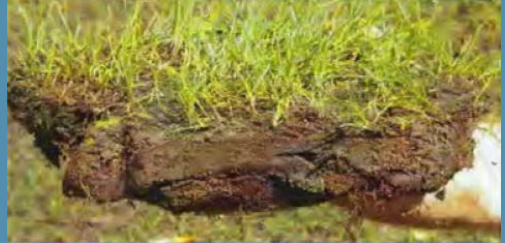
ST. AUGUSTINE GRASS WATERED EVERY DAY

MOST SPRINKLER SYSTEMS ARE PREPROGRAMMED TO RUN MORE FREQUENTLY THAN IS NECESSARY. CHECK THE DATE, TIME, AND DURATION OF WATERING ZONE SETTINGS ON YOUR IRRIGATION CONTROLLER TO SEE IF THEY SHOULD BE ADJUSTED. MANY CONTROLLERS OFFER A “CYCLE AND SOAK” FEATURE TO HELP REDUCE RUN-OFF AND A “SEASONAL ADJUST” FEATURE TO ADJUST WATER USAGE AND RUN TIMES BASED ON THE CHANGING WEATHER PATTERNS. WATCH THIS VIDEO TO LEARN HOW TO PROGRAM YOUR SPRINKLER CONTROLLER.